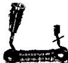
Cord Set with Candelabra Socket and Detached Plug