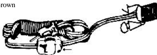
Cord Set with Snap in Candelabra Socket