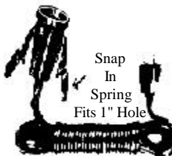
Cord Set with Line Switch and Snap in Candelabra Socket