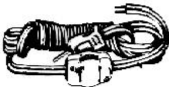
Cord Set with Line Switch