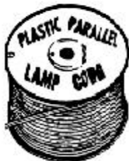
18/2 Lamp Cord by the foot